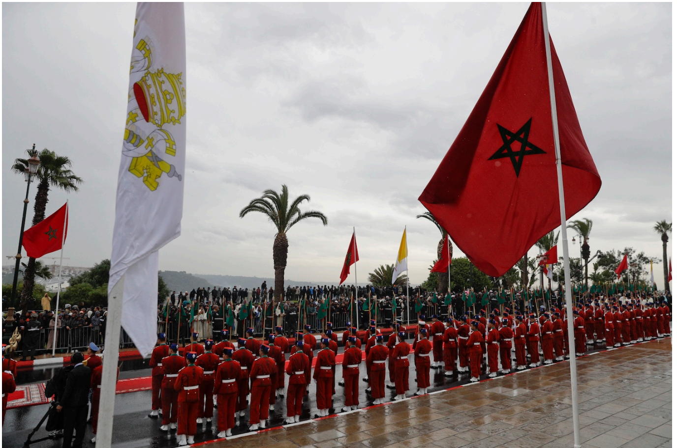
The honor guard waits for Pope Francis to arrive in Rabat, Morocco, Saturday, March 30, 2019.

Those who try to “rock the faith of a Muslim or to convert him to another religion” risk a prison term of up to three years.