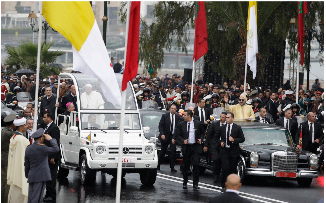
Pope Francis, on the popemobile, and Moroccan King Mohammed VI, right, waving, make their way through the crowd in Rabat, Morocco, Saturday, March 30, 2019.

The pope's plane landed in the capital Rabat shortly before 2 pm (1300 GMT) and he was greeted by the king who is known as the "commander of the faithful" in Morocco, where 99 percent of the population is Muslim. The Moroccan capital has stepped up security ahead of the first papal visit to the North African country since John Paul II in 1985.