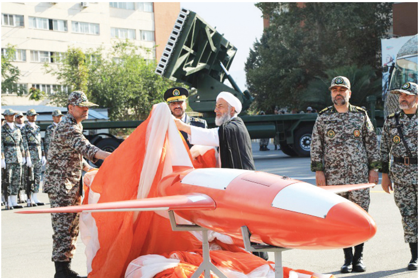
An Iranian Army Air Defense Force drone is unveiled during a ceremony in the capital Tehran. Iran is suspected by the US of being behind the drone attacks on Saudi Aramco facilities in the Kingdom on Sept. 14, 2019.

Targets have included the holy city of Makkah, airports, royal residences, oilfields and pipelines, oil installations and desalination plants.