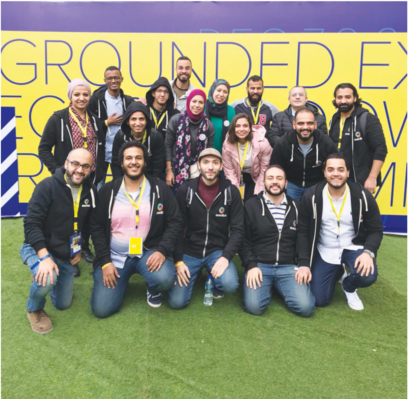
A new generation of startups are leveraging technology and tourist entertainment.