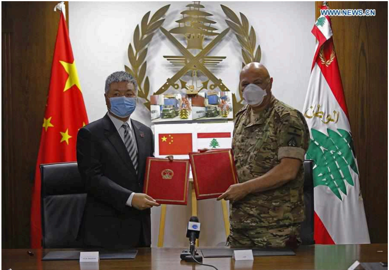
China’s military donated to the Lebanese Army medical supplies needed in the fight against the COVID-19 pandemic.

cleared, new roads and horizons will open up.”