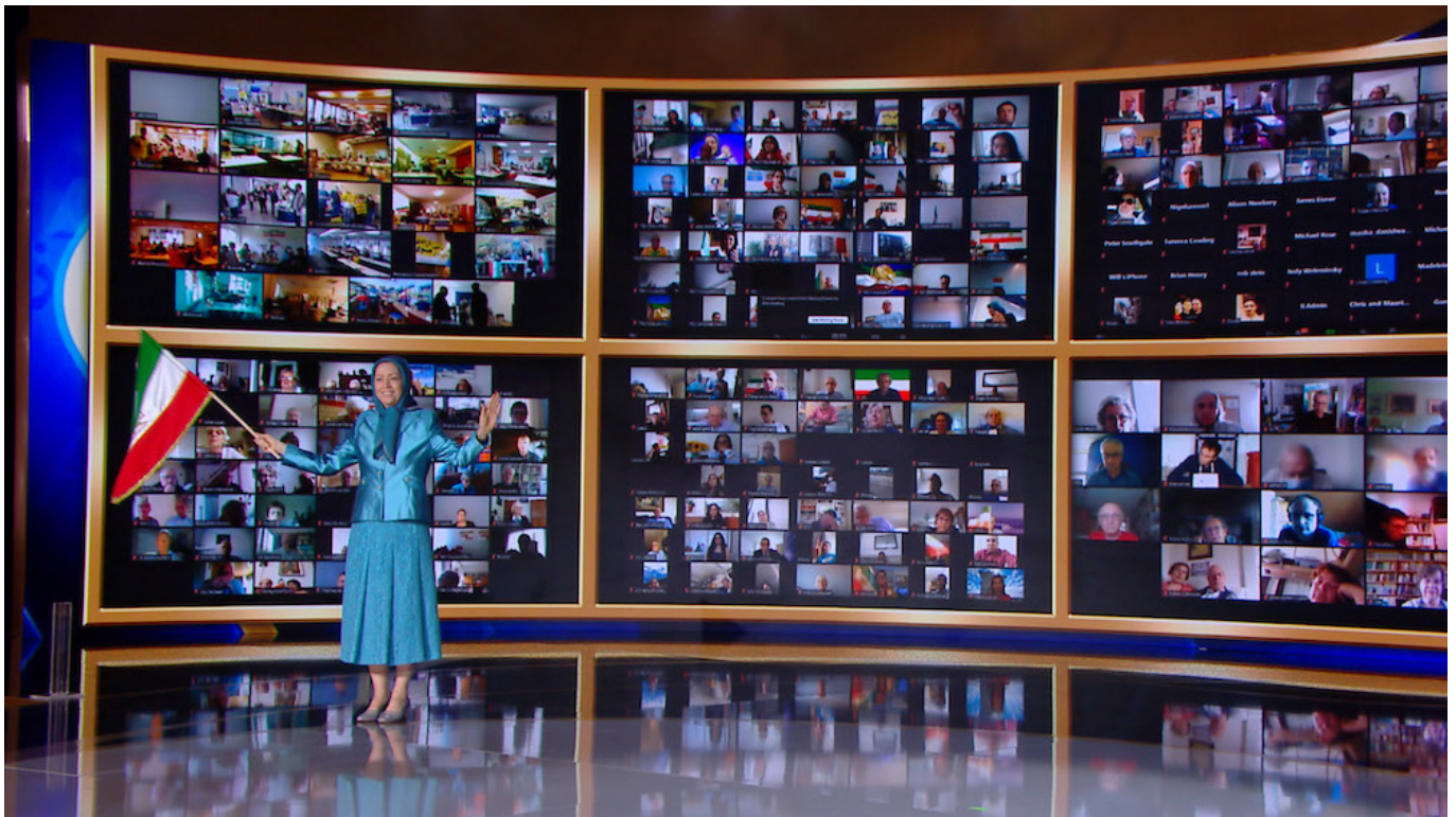
Leader of the People’s Mujahedin of Iran Maryam Rajavi during an event.

These attacks, Ridge argues, are more than illegal and unjust. He believes that Tehran’s relentless assaults on the NCRI betray its fear of the movement’s popular appeal.