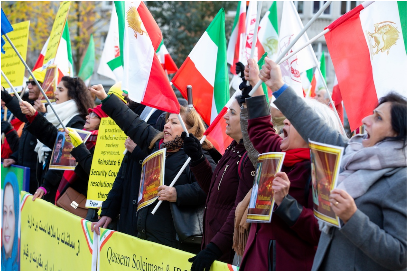
Supporters of the People’s Mujahedeen Organisation of Iran (PMOI) also know as Mujahedeen-e-Khalq (MEK) wave the National Council of Resistance of Iran (NCRI) party flag as they rally to protest against the Iranian regime on January 10, 2020 in Brussels.

Having been removed from the US list of terrorist organizations in 2012, the NCRI is increasingly being recognized as the most important player in the landscape of resistance to Tehran’s clerical regime – both at home and abroad.