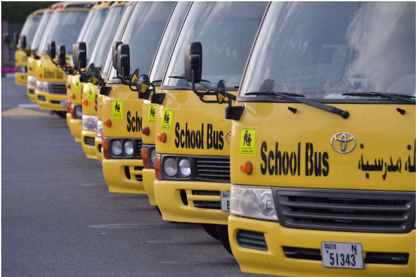
A picture taken on March 15, 2020 shows school buses parked outside a closed school in Dubai.

After all, one thing all parties seem to agree on when determining education's "new normal" is that safety comes first.