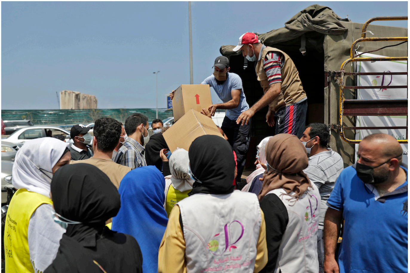
Volunteers distribute aid supplies to those affected by the cataclysmic explosion in Beirut's port area, on August 12, 2020.

"There's nothing more disturbing than thinking you're in the safety of your home and a sudden blast takes away all the security you thought you had in your adopted country," Ajami said. "As Syrians, this is our second loss. It's beyond description."