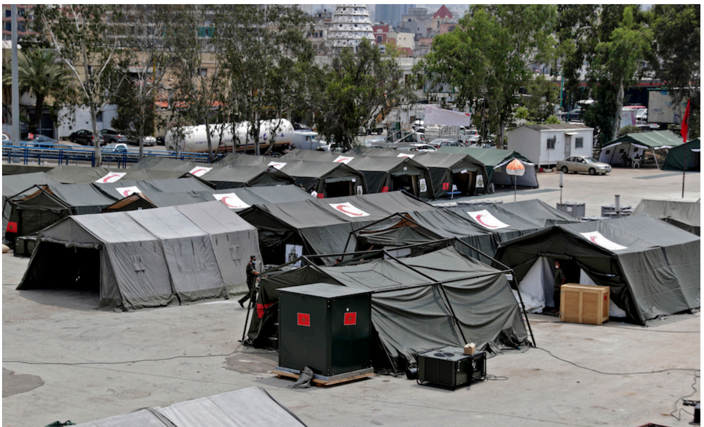
A general view shows the Moroccan field hospital in Karantina neighbourhood near the port of Beirut, on August 12, 2020.

She was allowed to cross the border into Syria after she took a COVID-19 test (for which she paid 150,000 Lebanese pounds) in Beirut and got a negative result.