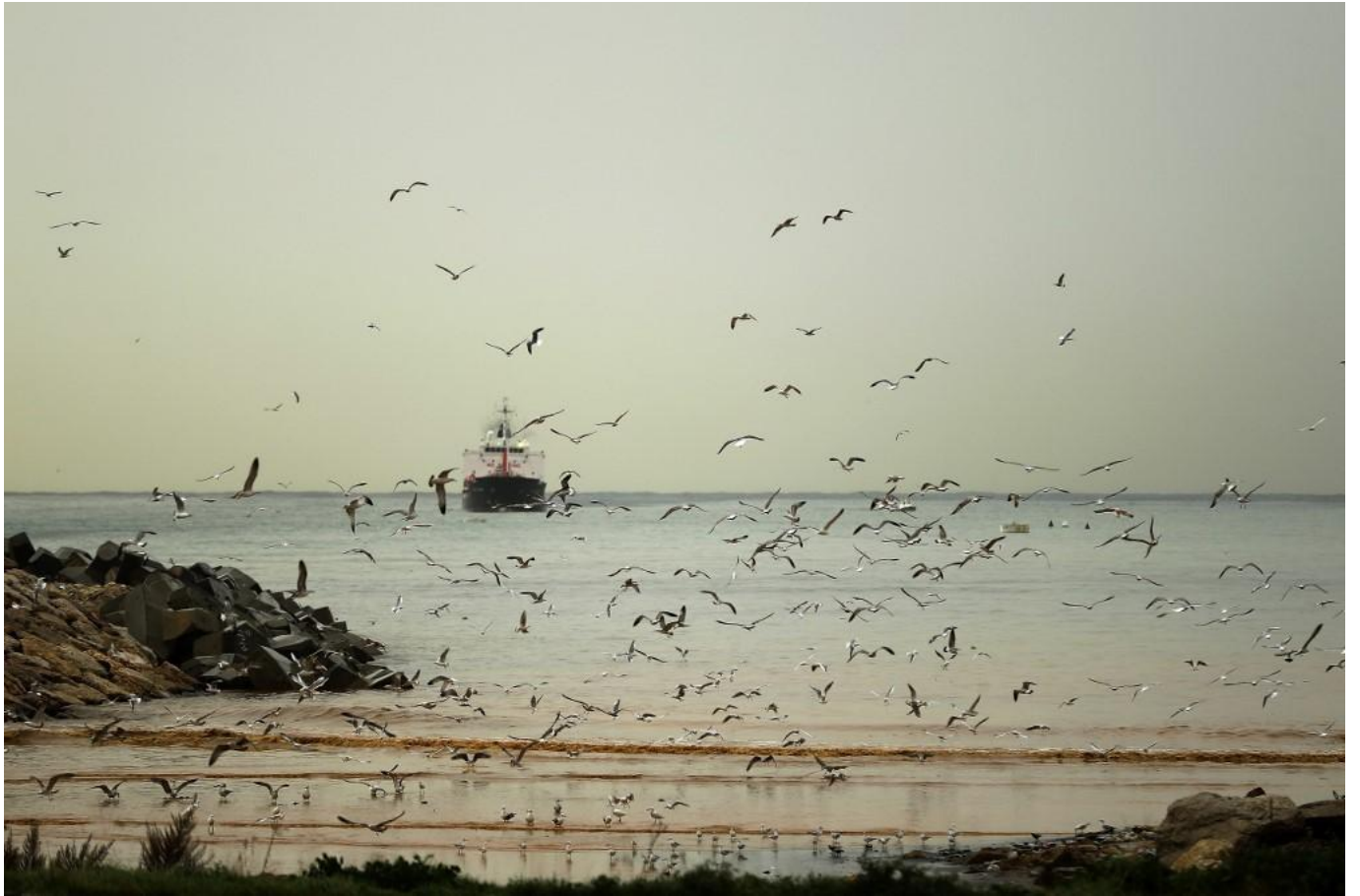
Main category: Middle-East