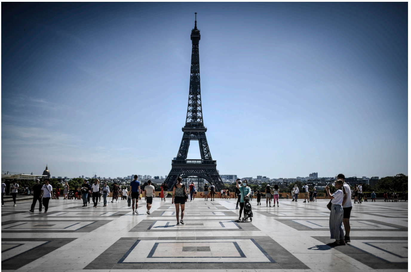
In this file photo taken on August 6, 2020 tourists visit the Esplanade des Droits de l’Homme with the Eiffel tower in the background, in Paris.

“The pandemic has the potential to really affect cities,” Peter Clark, professor of European urban history, has said, pointing not just to the exodus of people fearing infection – like they did from plague outbreaks in the medieval world – but also the long-term adoption of working and socializing habits that have become the norm during the coronavirus lockdowns.