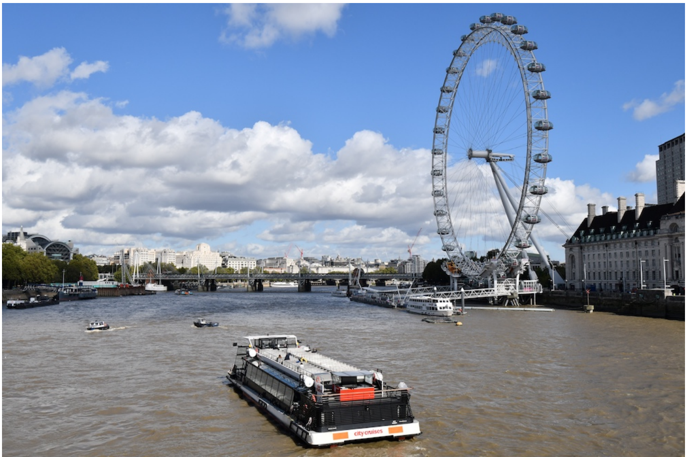
A near-deserted tourist boat travels past the London Eye in central London on September 24, 2020, during the novel coronavirus COVID-19 pandemic.

However, many experts believe that, although urban communities will have to adapt to the new post-pandemic reality, there is still much to admire and appreciate about city life. In the Middle East, home to many of the fastest growing cities on the planet, that is certainly the case. For example, it is hard to see dynamic hi-tech metropolises such as Dubai and Manama – fishing villages in the lifetimes of some of their older inhabitants – ever reverting to their previous roles.