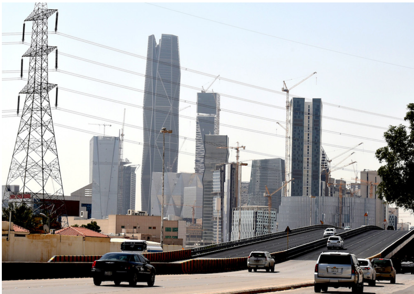
A picture taken on March 9, 2016 shows towers under construction at the King Abdullah Financial District in the Saudi capital Riyadh.

Nothing illustrates the dichotomy better than the age of the pandemic. Cities are the perfect incubator for the disease, as New York or Milan can tragically testify. But they can also be the location of the best healthcare facilities, and a better environment in which to lock down, as Singapore or Seoul bears witness to.