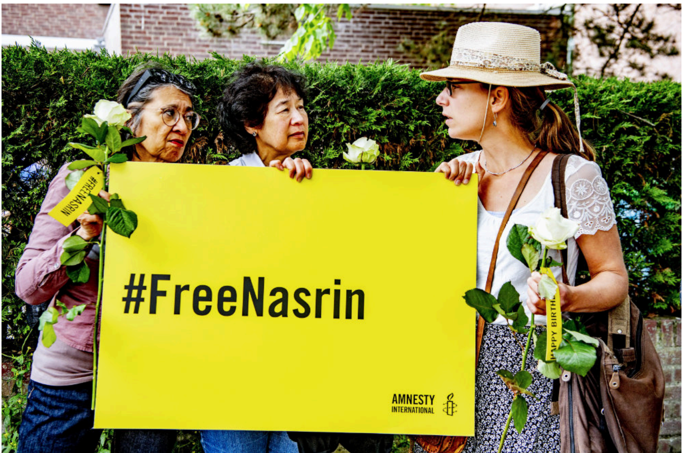
Supporters of Amnesty International campaign for the release of Iranian lawyer Nasrin Sotoudeh by celebrating a birthday party in front of the Iranian embassy in The Hague on May 31, 2019.

Tehran's treatment of women's rights campaigners has been particularly harsh. For example, Iran's Islamic Revolutionary Court sentenced 57-year-old Nasrin Sotoudeh, a leading Iranian human rights lawyer, to 38 years in jail and 148 lashes on charges of "disrupting public order and colluding against the system" for her work defending the rights of women. Amnesty has called the sentence an "outrageous injustice."