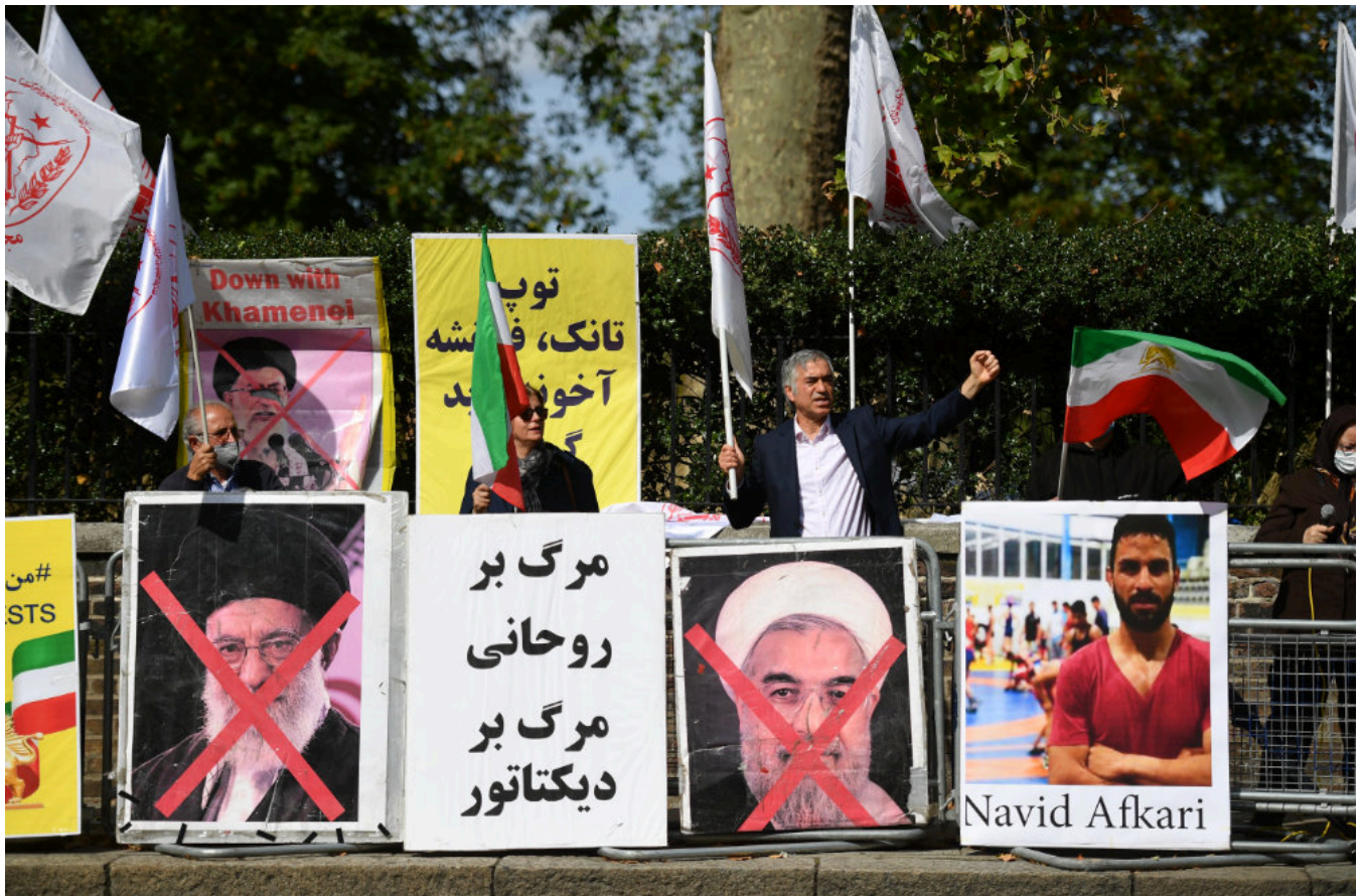
Protesters wave the Lion and Sun flag of the National Council of Resistance of Iran and the white flag of the People's Mujahedin of Iran, two Iranian

"The Iranian authorities are flexing their muscles," he told Arab News. "At a time when the general mood among Iranians is shifting away from the death penalty and the world is looking in horror at Iran's increasing use of it against protesters, dissidents and members of minority groups, the Iranian authorities are using executions, like that of Navid Afkari, as a tool of political control and oppression to instill fear among the public."