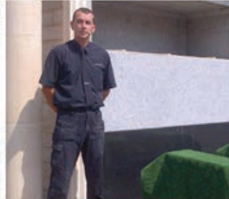
Interment Support Services