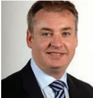
Environment Secretary Richard Lochhead

Environment Secretary Richard Lochhead said: