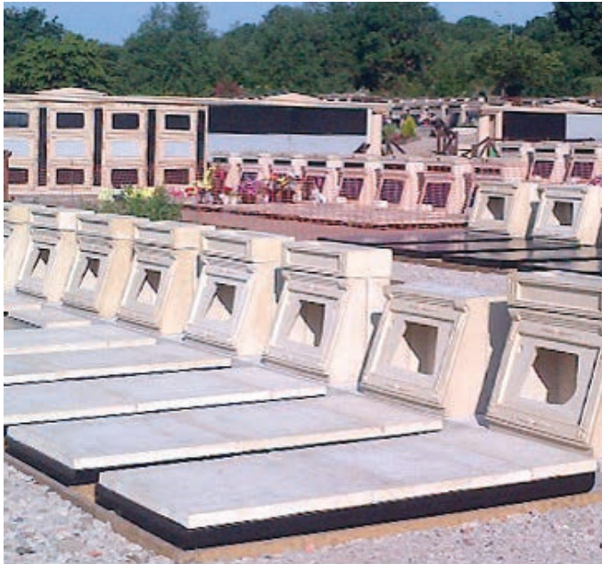
Fourth phase burial chamber during installation