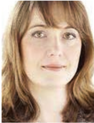
Dr Eilidh Whiteford MP

more to repairing the country's finances has "not been realised".