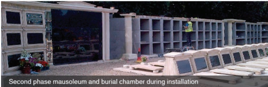
Second phase mausoleum and burial chamber during installation

welters® can design, supply, install and maintain above and below ground interment and memorial systems for any size and any budget on a fixed price or partnership basis; all supported by full inscription and burial support services .