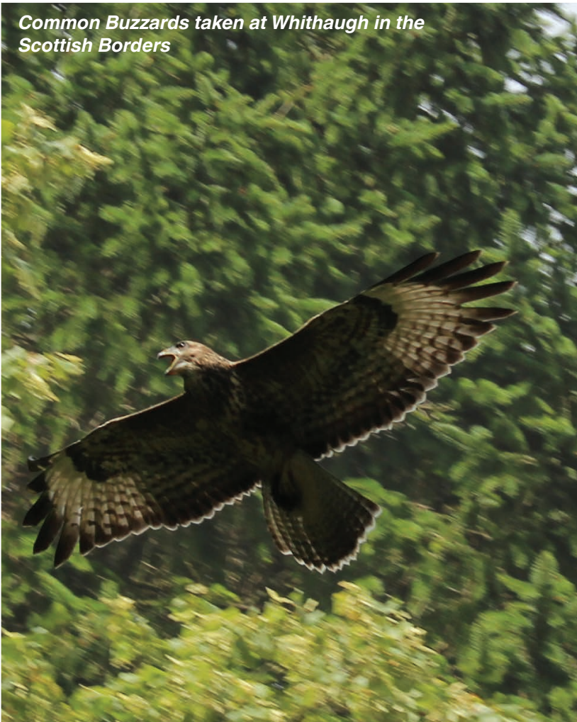
Common Buzzards taken at Whithaugh in the Scottish Borders