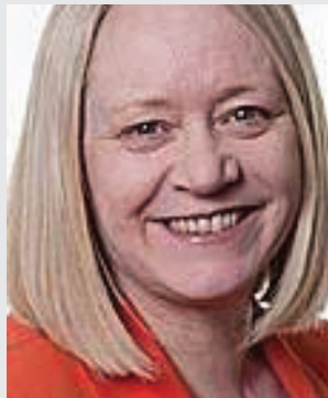
Cathy Jamieson MP

On reports HSBC 'helped clients dodge millions in tax', shadow Financial Secretary to the Treasury Cathy Jamieson MP said: