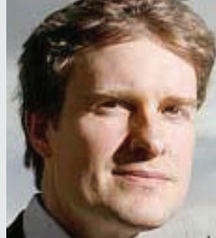
Tristram Hunt MP

Tristram Hunt will call for a renewal of our politics so that young people are better able to thrive in the modern world, confident of our history and our values.