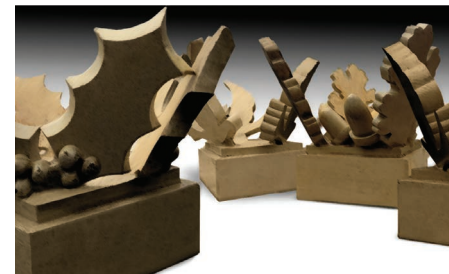
Cover picture: welters ® Stone Sculptures