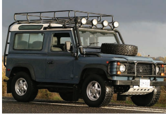
1997 Defender 90 Hard Top

Where do you begin when writing about the Land Rover Defender and how can you send it off in style? They were the two questions I kept asking myself when I decided to write this and to be honest I am still not sure where to start. The Defender has been in production for 67 years, if you take into account its evolution from the Land Rover Series I, and the changes to the design have been fairly minimal.