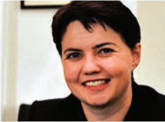
Scottish Conservative leader Ruth Davidson

Nicola Sturgeon is ignoring both scientific fact and the wellbeing of Scotland's food and drinks industry by pushing ahead with plans to ban GM crops, the Scottish Conservatives have said.