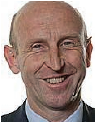
John Healey MP, Labour's Shadow Cabinet Minister for Housing and Planning

To coincide with the launch of the 'Help to Buy: ISA' scheme, Labour has released figures showing the scale of the challenge for young people wanting to buy their own home after five years of Tory failure.