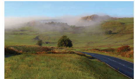
Cover picture: Scotch mist