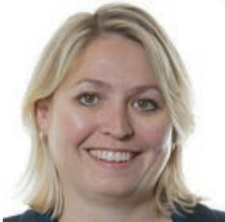
Karen Bradley MP

The Minister for Preventing Abuse and Exploitation has announced the commencement date for mandatory reporting of female genital mutilation (FGM) and published guidance to help professionals get ready for the new duty.