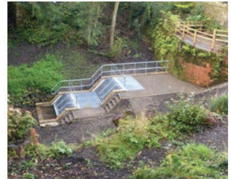
The new culvert screen on Ibbot Royd Clough

“It is very pleasing to see the Nutclough scheme complete. This is the latest milestone in the Council and Environment Agency’s joint work to reduce flood risk across the Upper Calder Valley. It’s reassuring that the work is already making a difference and protecting our local communities.”