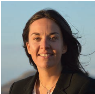
Kezia Dugdale is a regional MSP for Lothian and Leader of the Scottish Labour Party.

At First Minister's Questions Kez highlighted new figures which showed the SNP's claims about oil were out by more than 6,000%.